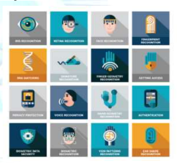
Fig.1 the various types of Biometric authentication

it describes the various types of biometric authentications. the some of the available biometric authentications are IRIS Recognition, retina Recognition, Face Recognition, Fingerprint Recognition, DNA Matching, Signature Recognition, etc.